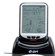
Energy Saving Monitor