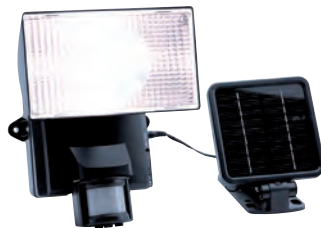
Solar Security Light