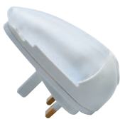
Dusk to Dawn Nightlights